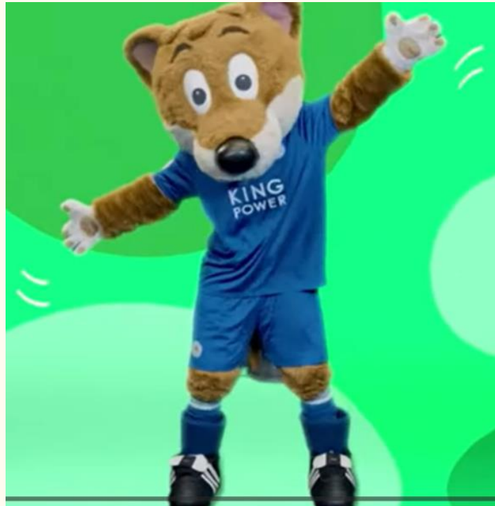
Filbert fox - 8 times table