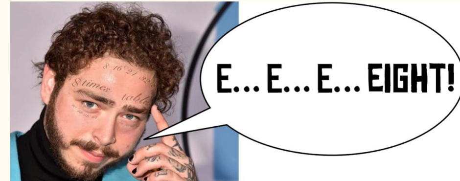
8 times table song (Sunflower by Post Malone) - YouTube