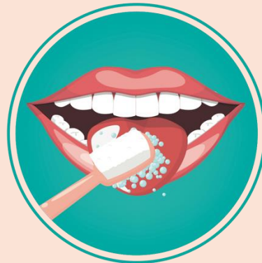
Brush the tongue