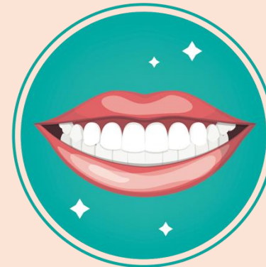
Congratulations! Note: remember to floss.