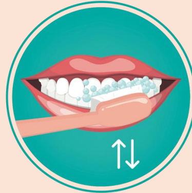
Brush the outer surface of all teeth using up and down motion