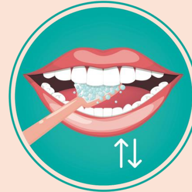
Repeat for inner surface of all teeth