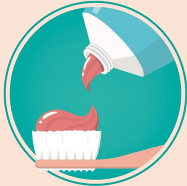
Use a small amount of toothpaste