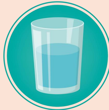
Rinse out your mouth using water