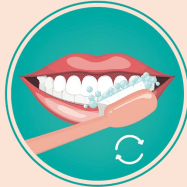
Brush the outside surface of all teeth using circular motions