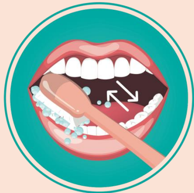
Brush the chewing surface of all teeth for 2 minutes twice a day