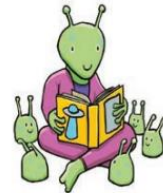
get near to hear