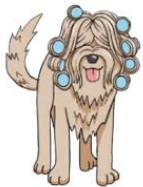
curl the fur

Phonemes we will be focusing on this week in school –